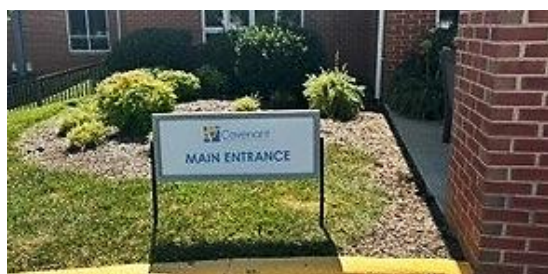
Main Entrance Sign