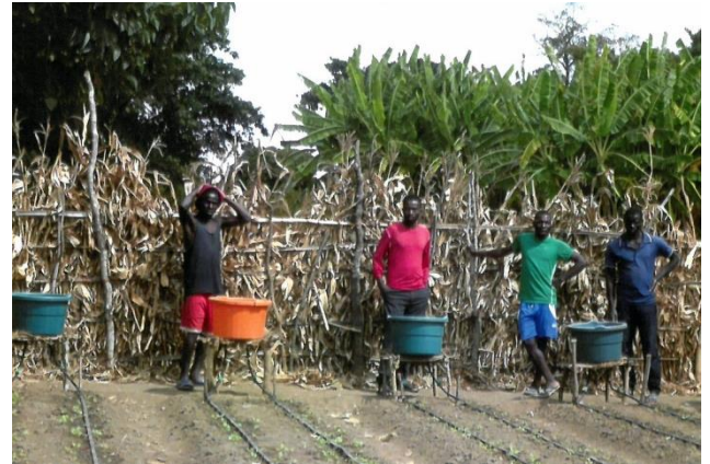
Drip irrigation in a new village garden. The buckets are filled with water twice daily, which drips through the hoses next to the seeds and plants.