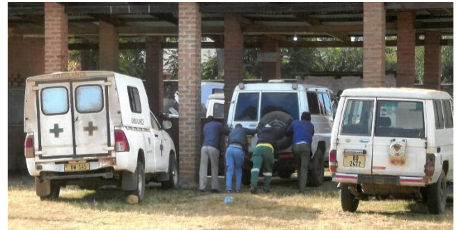
Hospital vehicles being pushed into a bay for repair. It will take $10,000 to get the ambulances and vehicles back into good dependable condition.

Results! The real outcome of this "multi-project" mission is working alongside the people of Malawi in their space and living situations. All of our projects had local people involved in the planning and execution of activities. With "feet and eyes on the ground" we again know what the needs and wants are for continuing our future projects and Christian relationship with Malawi.