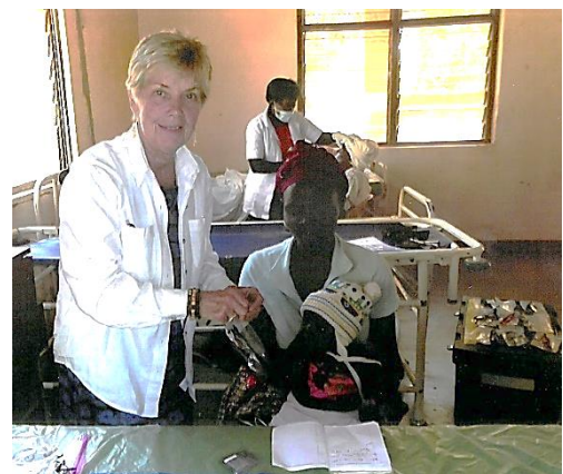
Kalikumbi Eye Care Clinic