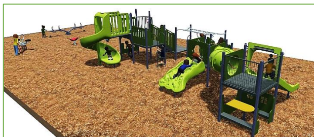
New Playground Plan